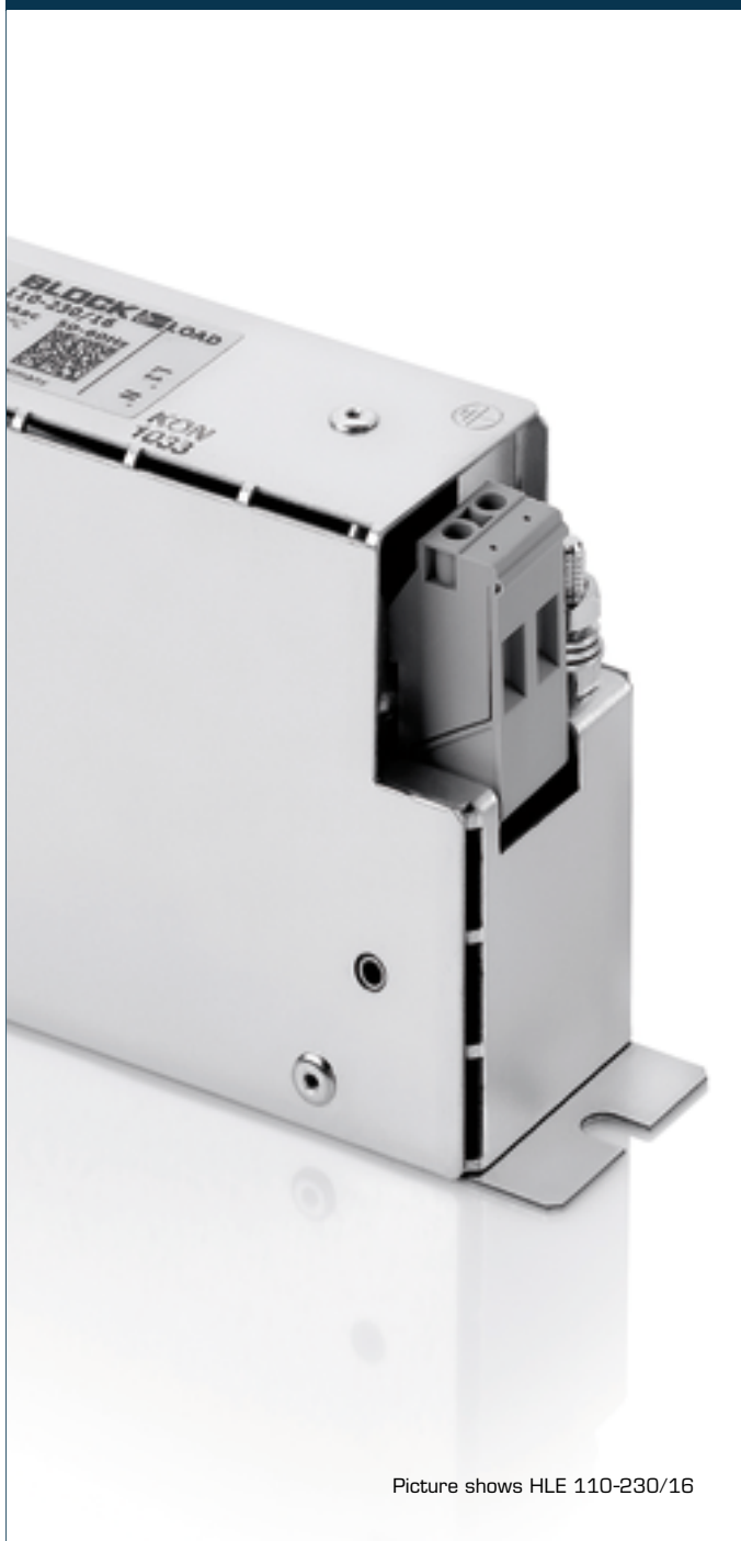
Picture shows HLE 110-230/16